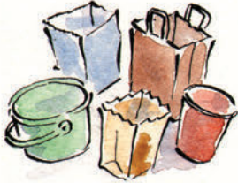
ONE BUCKET OR PAPER BAG PER PERSON