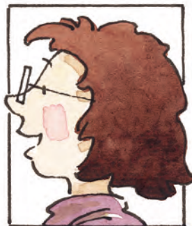
Liz (the sitter)