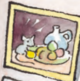
Still Life with Mouse