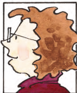
Liz (the sitter)