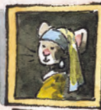
Mouse with a Pearl Earring