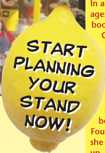
Lemonade Days in Minneapolis (above) and Atlanta (below)