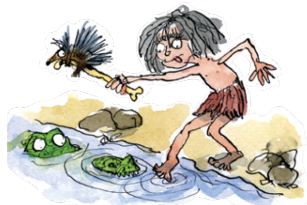
Remember to bathe when you're down at the creek,