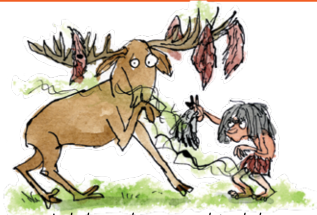
And please change your loin cloth at least once a week.