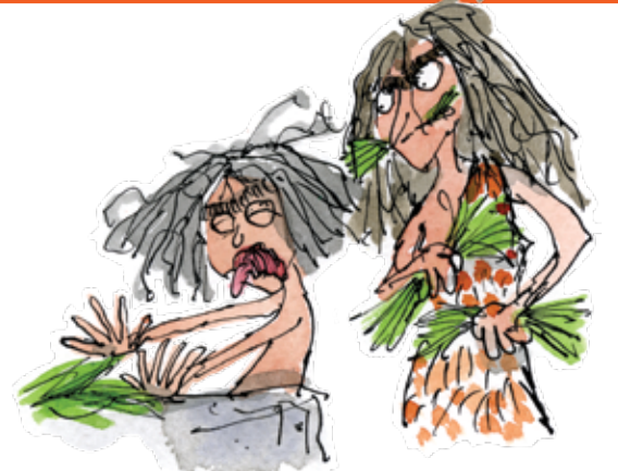
If you can't grumble nicely, then don't bother blathering.