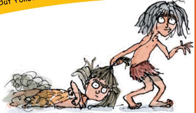
Don't drag your sister around by the hair.

A caveman's behavior is commonly crude, But follow these steps and you won't be so rude: