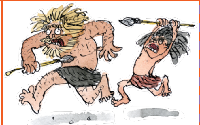
Don't chase the grownups while hunting and gathering.